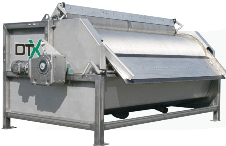
DTX 96" Model