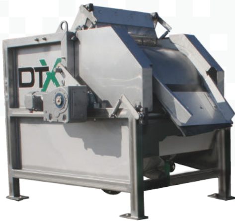
DTX 24" Model