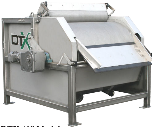
DTX 48" Model